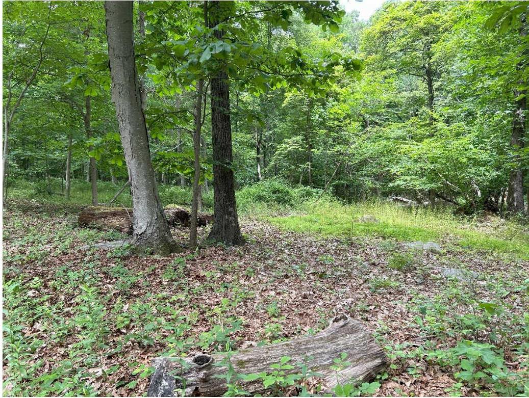
Photo #3 – Looking west toward the proposed drive and parking area from the existing path