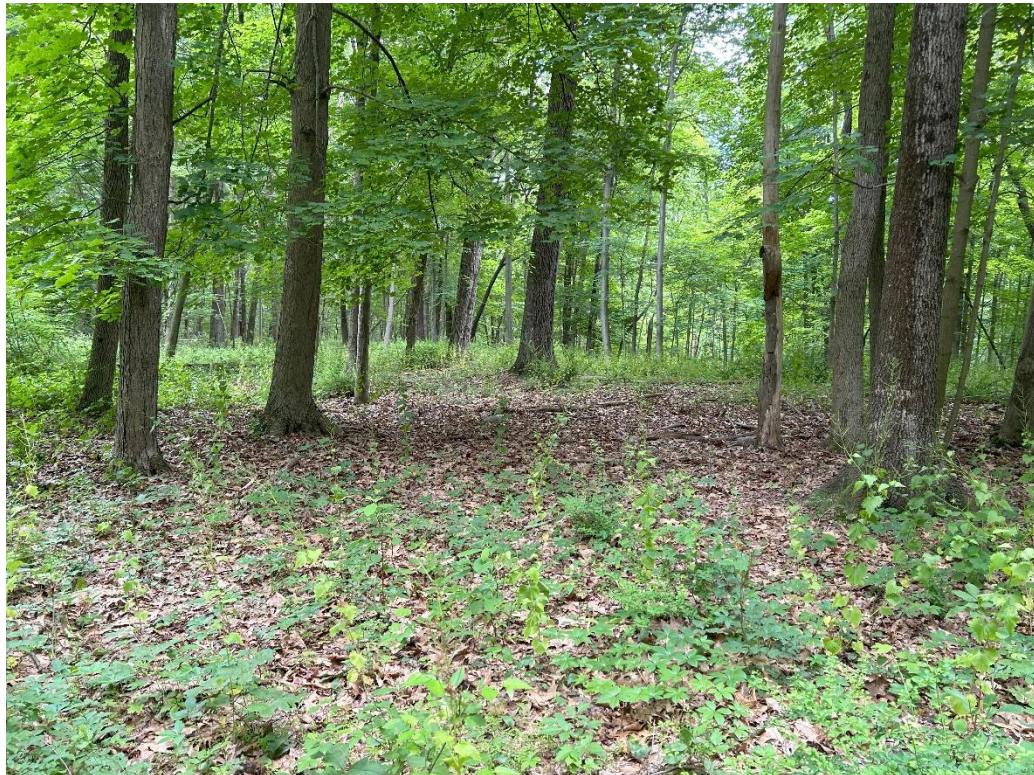
Photo #6 – Looking east toward proposed dog park from the existing path