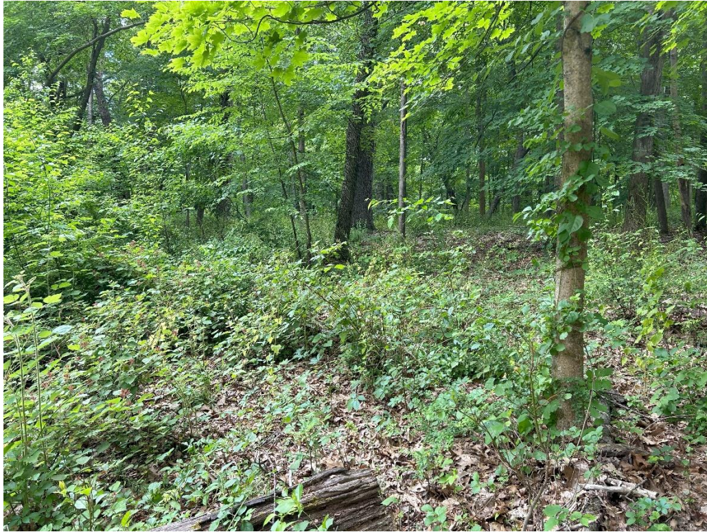
Photo #5 – Looking southeast toward proposed dog park from the existing path