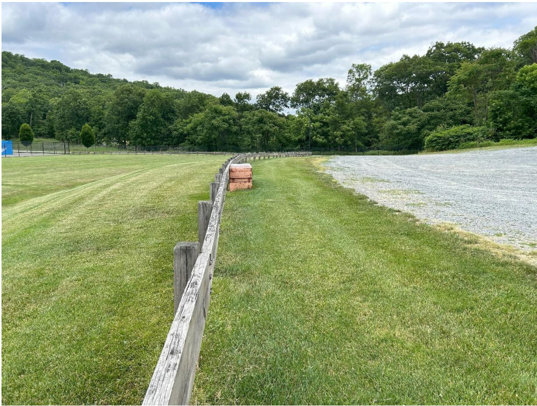
Photo #19 – Looking northeast along edge of existing gravel parking area