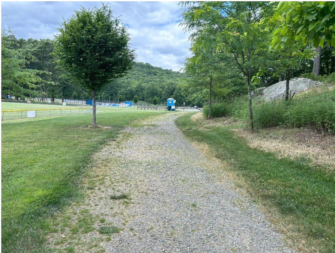
Photo #17 – Looking north along existing gravel drive toward the gravel parking area