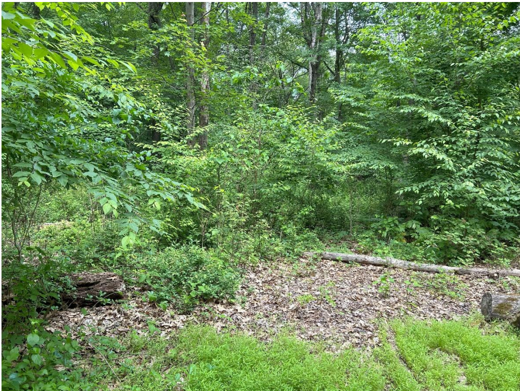
Photo #4 – Looking north toward proposed walkway and parking area from the existing path