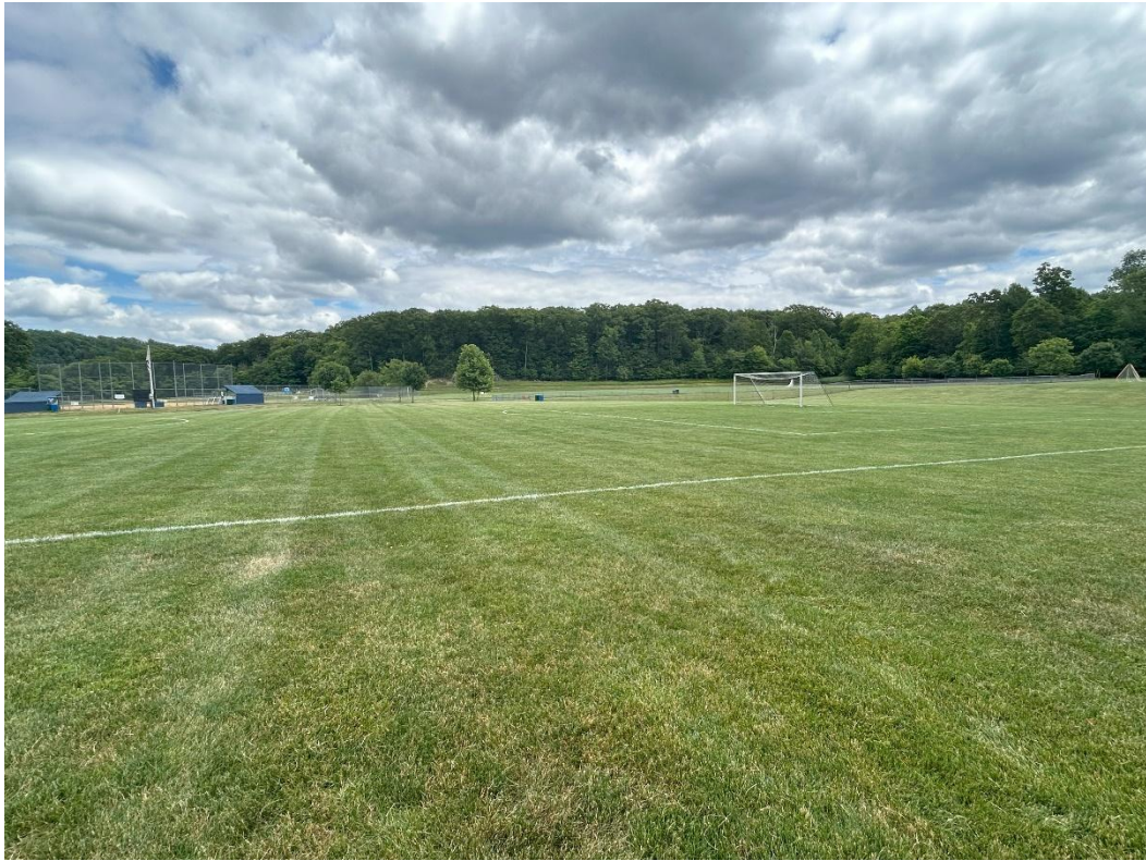
Photo #9 – Looking southeast toward existing athletic field and proposed basin