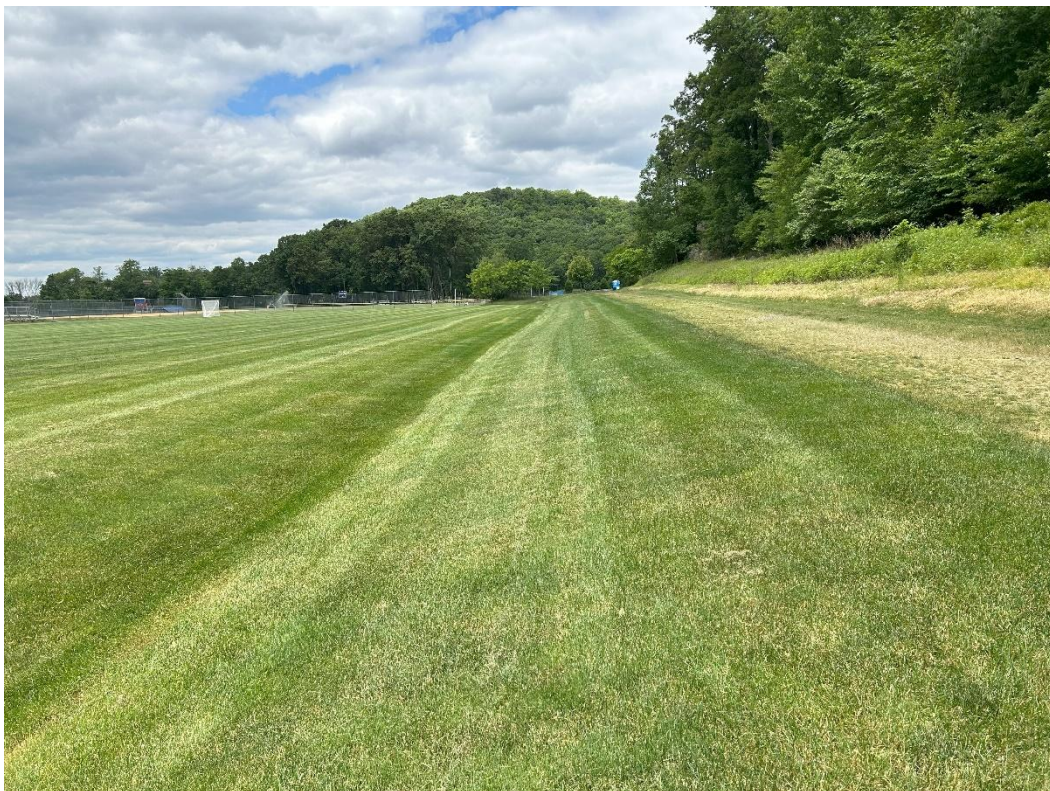
Photo #16 – Looking north at edge of athletic field and gravel drive